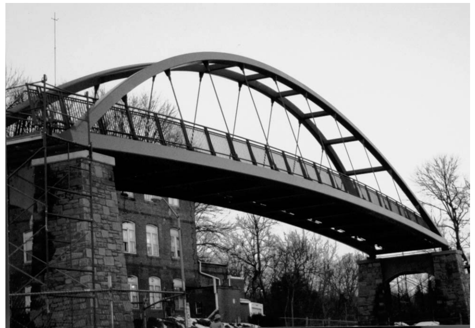
Now that the Roland Avenue and Northern Parkway bridges (above) are up, how has the community reacted to them?

The construction has caused numerous hardships, met by those affected with mixed reactions. Overall, the community is coping well with the situation and believes that the bridges will ultimately provide a safer environment for the tri-school students.