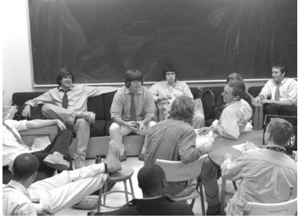
A group of seniors enjoys their lunch in what space there is in the new senior room.