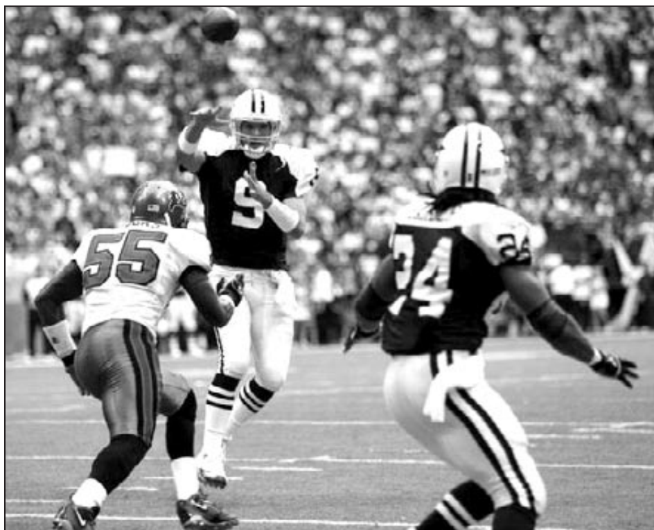
Cowboys Quarterback Tony Romo throws to running back Marion Barber. Romo, who has been one of the top fantasy QB's this year, led the Cowboys to five straight wins to start the 2007 season before falling to the Patriots in Week 6

on the Baltimore Ravens. Now every team and every player is discussed in thorough detail. Every game is now extremely important, even the certain blowout win, or the game between the two worst teams in the league. On any