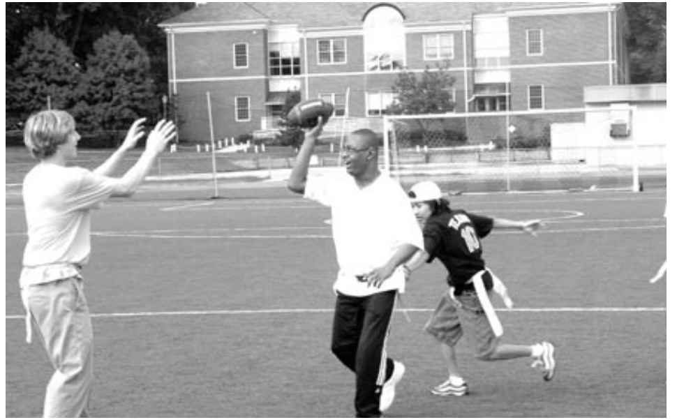
Beautiful weather favored Gilman on September 28th, when students took a break from books to learn outdoors.

It appears that Mr. Bedine exemplifies the old phrase that sometimes in order to move up, you have to move on. □