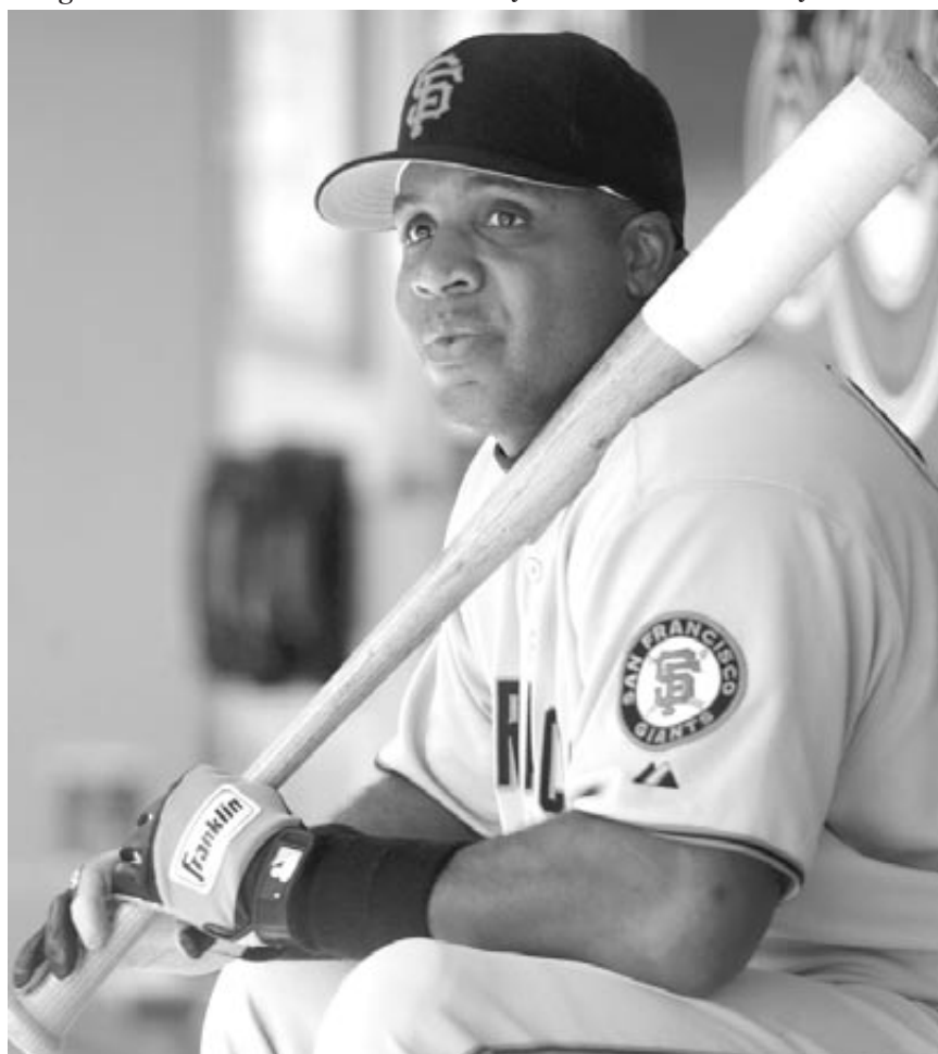
Amidst a flurry of controversy, Barry Bonds broke Hank Aaron's career home run record on August 7th

But the reality is that there is only one Barry Bonds. I'm not making excuses for him and I'm certainly not advocating his likely use of illegal substances. I am, however, asking that you at least give the man his due respect and commendation. And for those of you out there that still hate Bonds and think he belongs in a Turkish prison for his crimes to humanity and the game of baseball, have no fear. A-Rod appears to be well on his way to putting his own name atop the all time home run list. But until then, let's all give a few props to the game's current home run king. He's earned it. Sort of. □